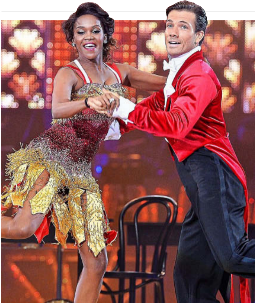
Mac-nificent: Danny dazzles with his professional partner Oti Mabuse